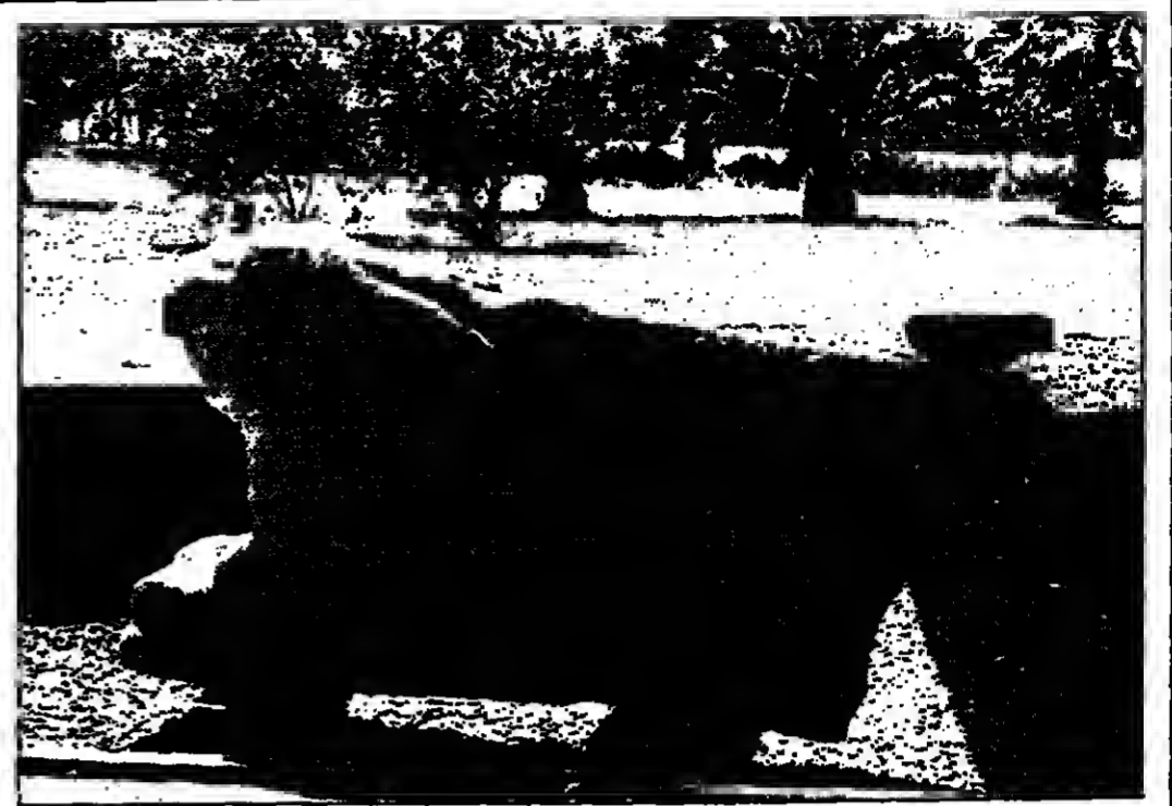
New find at Tel Hazor

"It is not true that the legislation would compensate only a minuscule remnant of Polish Jewry in only nine Polish cities. Firstly, it is not a law dealing with compensation but with restitution of property of religious communities only. Secondly, the law enables proper organizations and institutions to set up a foundation which will be legally authorized to take care of the property. Both WJRO and the World Federation of Polish Jews may become partners in the foundation provided it is deemed appropriate." "It is also untrue that the legislation takes into account only nine cities in Poland where contemporary Jewish religious communities have been established. Activities of the foundation will cover the whole territory of Poland, with the hope that it will support active people willing to contribute to the communities of Bialystok, Lublin, etc." "However, implementation of the law depends on both sides, on understanding the essence of friendly Polish-Jewish relations, of using the language of cooperation and dialogue which has been the aim of the Polish legislators."